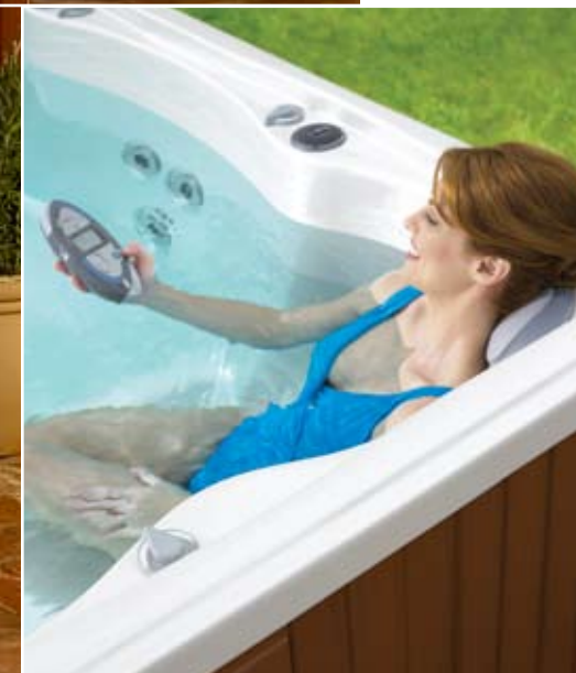
La Palma spa shown with Pearl shell and Redwood cabinet plus optional music system.

Make the right choice. Bring home a Hot Spot spa — and relax.